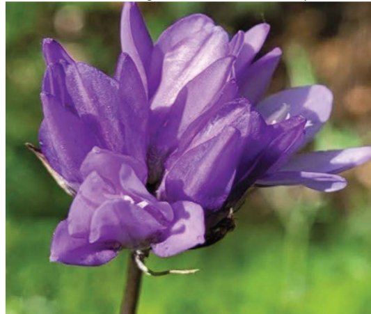
Blue Dicks ( Dipterostemon capitatus ) FEB-MAY. Corms a traditional food source.