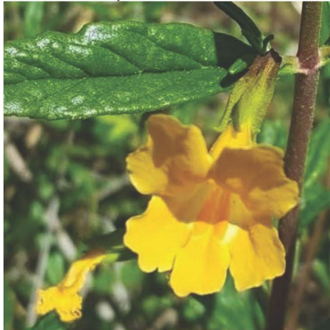
Sticky Monkey Flower ( Diplacus aurantiacus ) MARCH-AUGUST. CA native.