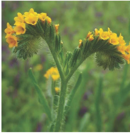
Fiddleneck ( Amsinckia sp.) FEBRUARY- JUNE. Poisonous to cattle.