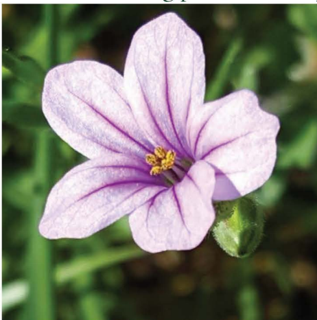
Mediterranean Stork's-Bill ( Erodium botrys ) aka Filaree, invasive species