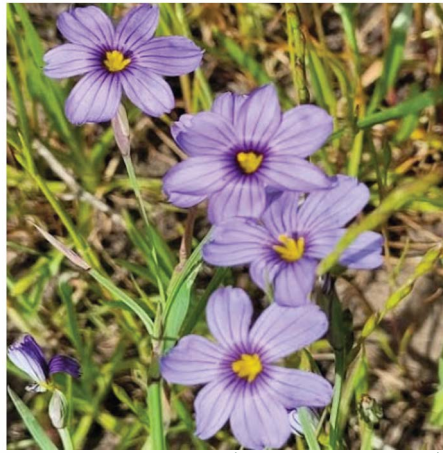
Blue-eyed Grass ( Sisyrinchium sp.) MARCH- JUNE. Iris family.