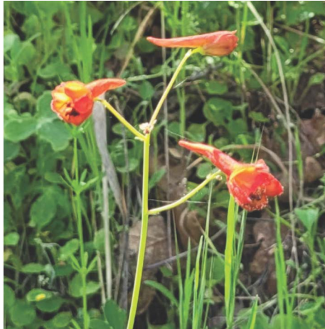
Red Larkspur ( Delphinium sp.) MARCH- JUNE. Buttercup family 1-2 feet stems.