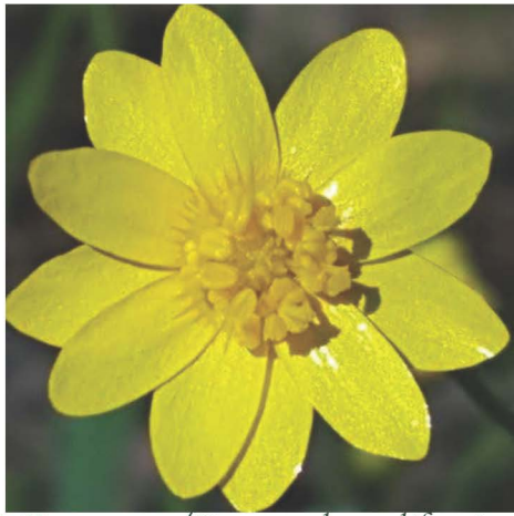
CA Buttercup ( Ranunculus californicum ) FEB-MAY. Glossy Petals, Latin: "Little Frog"