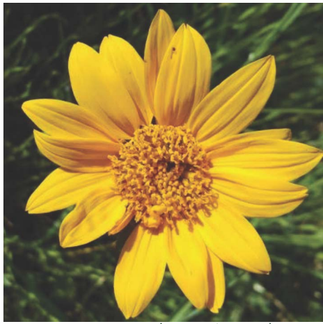
Mule's Ears ( Wyethia sp.) MARCH-JUNE. Sunflower Family 2-3" wide