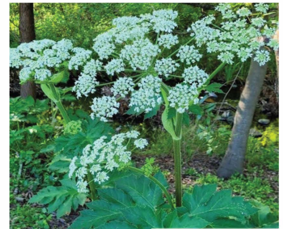
Common Cowparsnip ( Heracleum maximum ) Carrot family, 6' tall.