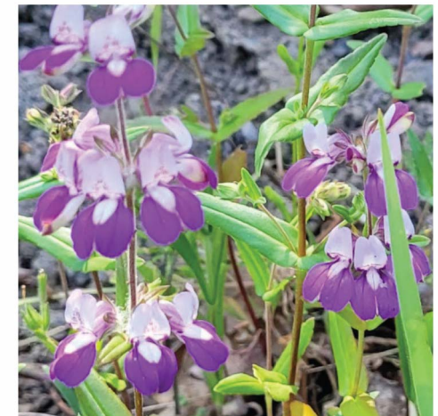
Purple Chinese Houses ( Collinsia heterophylla ) MARCH-MAY.