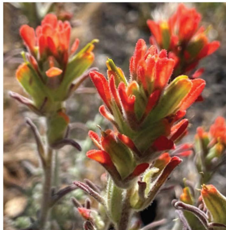
Woolly Paintbrush ( Castilleja sp.) FEB-APRIL. Bright red leaves look like petals.