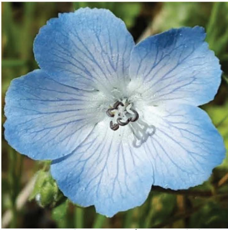
Baby Blue Eyes ( Nemophila sp.) MARCH-JUNE. White varietal also in park.