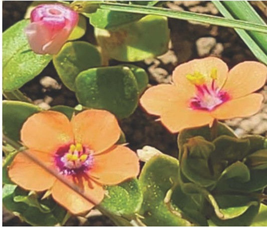
Scarlet Pimpernel ( Anagallis arvensis ) MARCH-JUNE. Non-native, low growing.