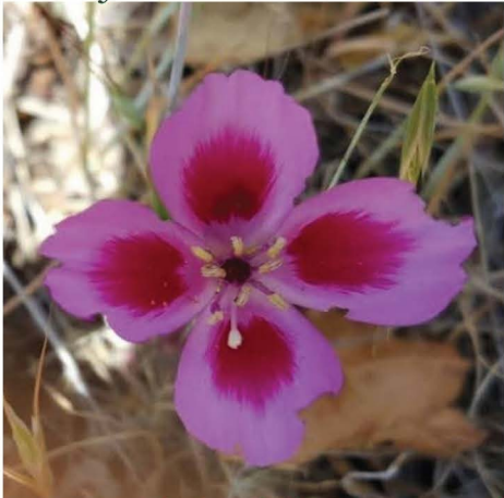
Winecup Clarkia ( Clarkia purpurea ) FEB-MAY. Evening primrose family.