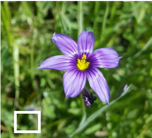
6. Blue eyed grass Sisyrinchium bellum

March-May This flower loves the sun, it takes about 4 hours of direct sunlight for the flower to fully open up.