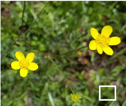
8. California Buttercup Ranunculus californica