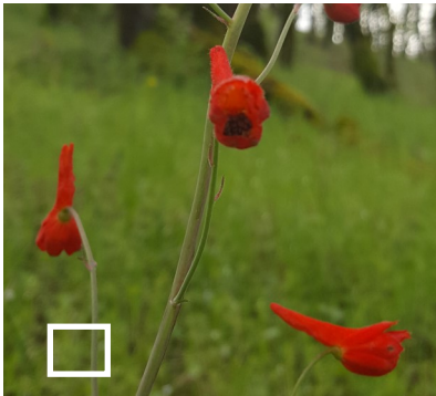
10. Canyon Delphinium Delphinium nudicaule March-June

Native Americans made tea from the roots