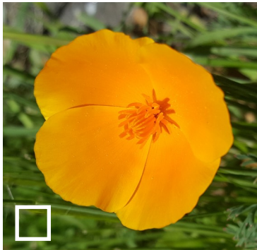
1. California Poppy Eschscholzia californica

As we trek along and have our fun, look out for lizards and snakes trying to get some sun. They'll lie on a rock or out in the path, to take their reptile sunbath.