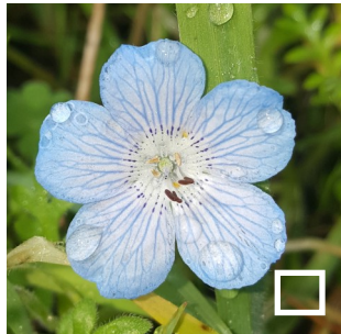
3. Baby Blue Eyes Nemophila menziesii February-June

The essence of this flower is used in therapeutic medicine